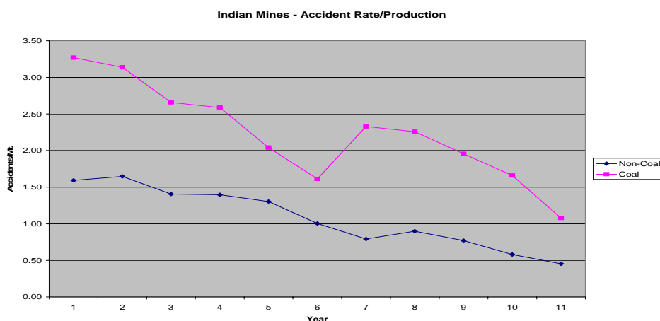
Chart B.4 Indian Mines: Accident Rate with respect to Production - 1994 to 2004.

While Table B.5 below is not directly comparable with figures for serious accidents presented above, in that it relates the fatality rate to production levels for coal mines, it demonstrates the progress being made in India in the reduction of the incidence of coal mine fatalities. However it also demonstrates that in comparison to the ‘developed’ countries of U.S.A and Australia, fatality rates are too high and continuing attention to reducing these is mandatory. India, with the assistance of Australia has demonstrated a commitment to this objective.